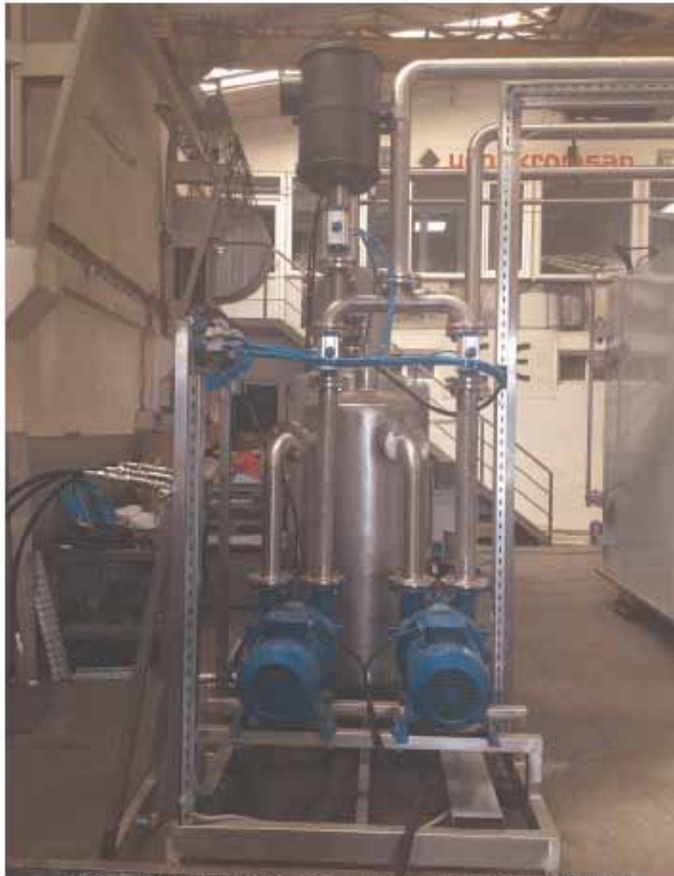
34 M3 STERILIZER MACHINE PARK VIEW – HEPA FILTER – ENGINES