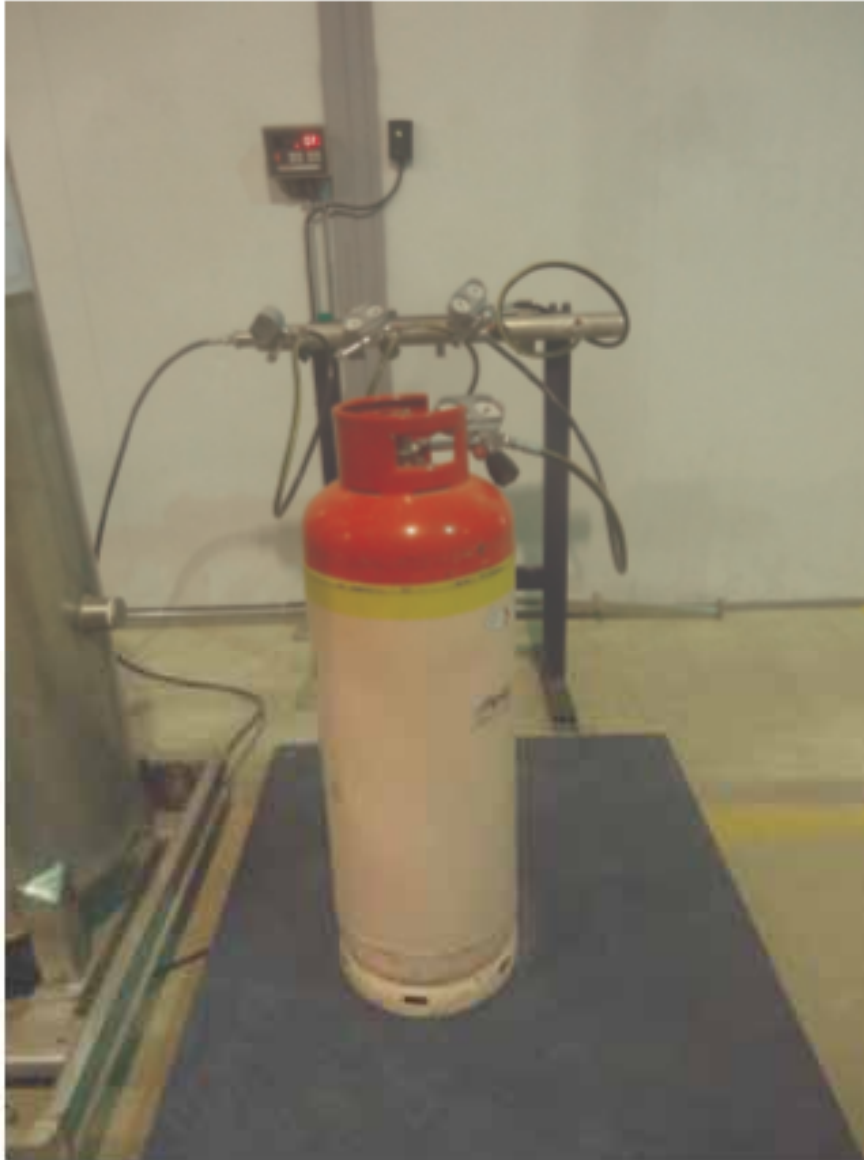
ETO CYCLINDER – SYSTEM SCALE